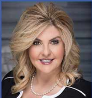
Councilwoman Michele Fiore