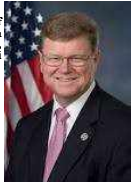
Lincoln Day Dinner Master of Ceremonies, Nevada Congressman, Mark Amodei